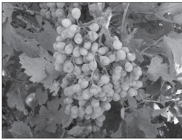
Fig. 4. Severe powdery mildew symptoms on a highly susceptible variety (Rasmi)