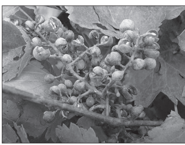
Fig. 5. Grape cluster infected with powdery mildew on a highly susceptible variety (Gharashilig)