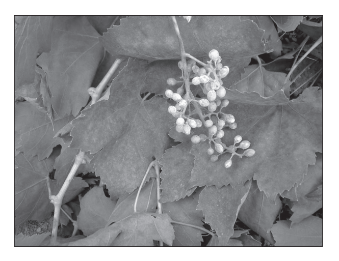
Fig. 2. Oidia of the powdery mildew fungus formed on young berries on a highly susceptible variety (Rasmi)