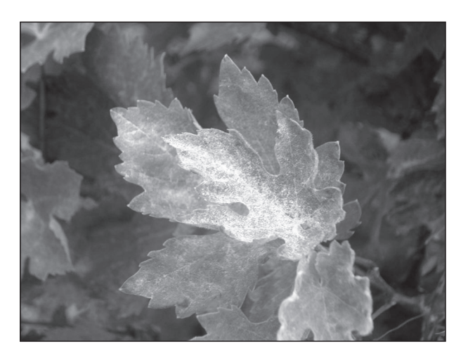
Fig. 1. Severe powdery mildew infection on a susceptible grape variety (Kopakboghan)