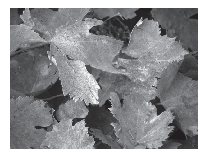
Fig. 3. Powdery mildew infection on a susceptible variety (Aldarag). Note whitish mildew and purple discoloration on the leaves