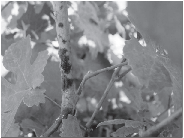
Fig. 6. Tissue discoloration due to an early U. necator infection on a highly susceptible variety